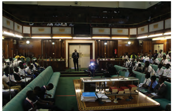
Advance Afrika Country Director, addressing participants of the 2016 National School Debate Championship at Parliament of Uganda