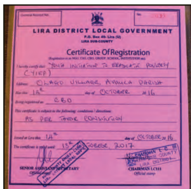
The Sub-county registration certificate of YIEP