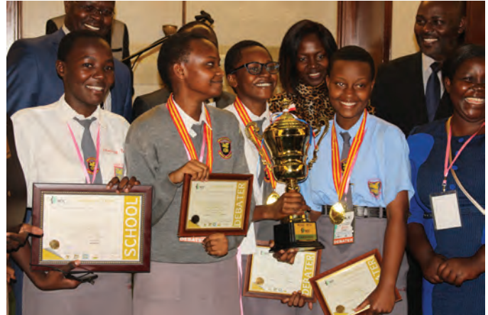
Mengo Senior School, the Champion of 2016 National School Debate Championship

The National Schools Debate Championship is an annual event for secondary schools and Uganda's most celebrated debate championship organized by the National Debate Council and hosted by Parliament of Uganda. It has been happening since 2009 and is national in character. The week long, fully residential championship brings together students from across Uganda to debate on a given theme.